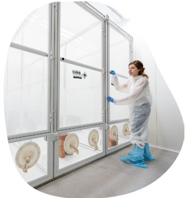
These cage studies typically involve stable overlapping-generation populations of up to 1000 mosquitoes at the start and last for up to one year

Target Malaria partners in Africa must submit, as a minimum requirement, a regulatory dossier, which includes all required information needed to assess the characteristics and safety of the mosquito strain, to the competent national